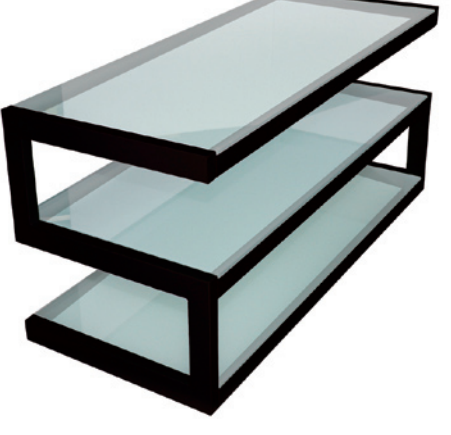
Glossy black and black glass