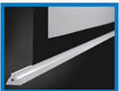
Triangular low bar retracts into the case