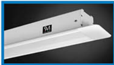
Handsome white powder coated case provide a solid structure and clean look.