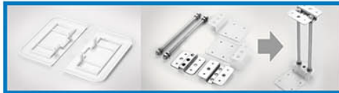
Specially designed brackets allow easy installation for all ceilings.