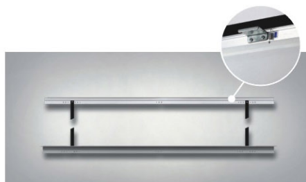
Easy mount brackets