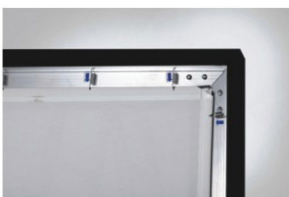
Fixed-Frame adjustable tension system

HD Cinema, High Contrast Pur-Mat, HD Rear , Acousion Classic C, Acousion Classic A,,DCS Optical, BS Optical,3D Optical.